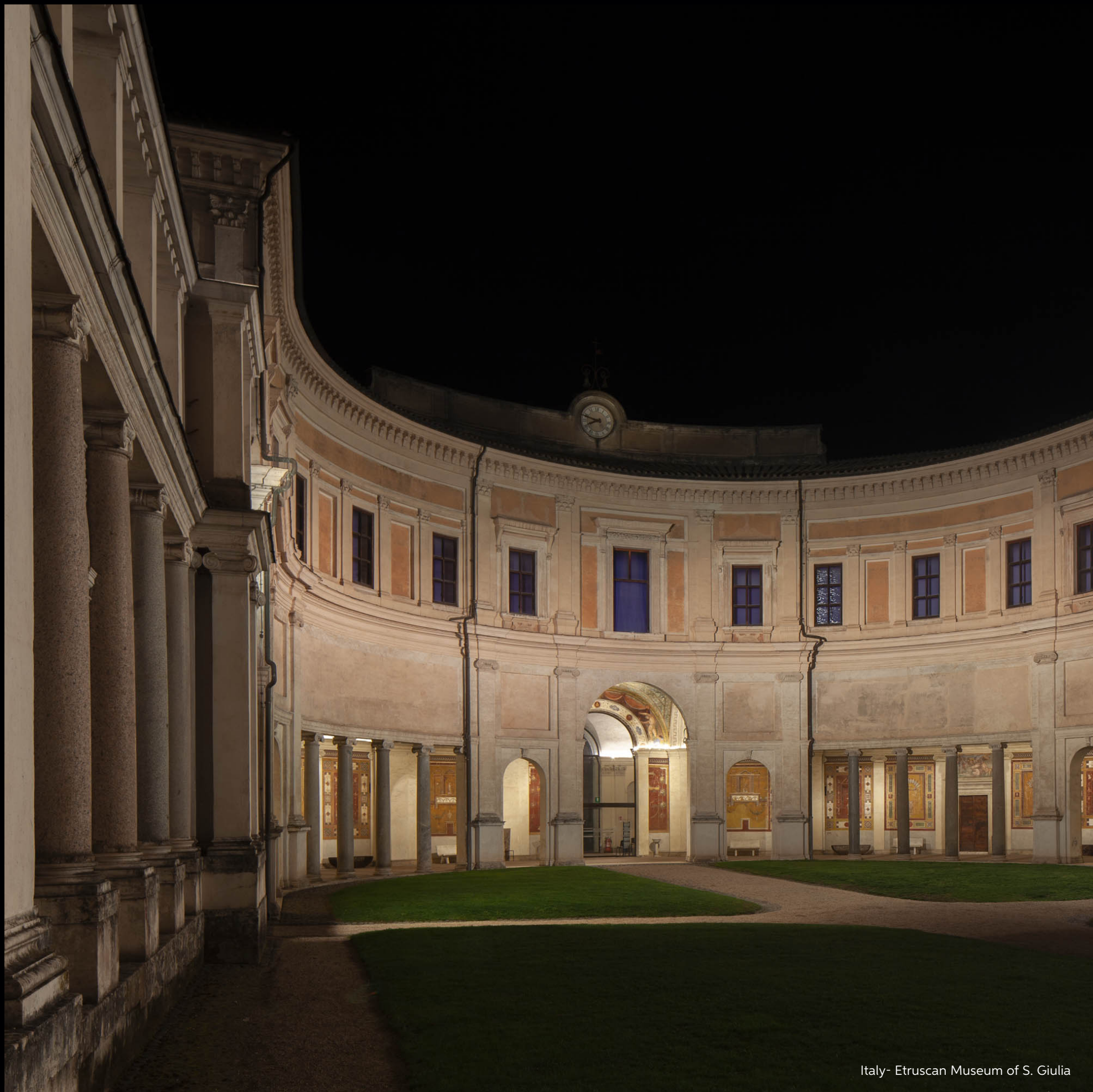
Italy- Etruscan Museum of S. Giulia